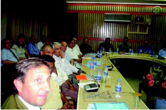
Attentive participant of an ICMQ workshop.