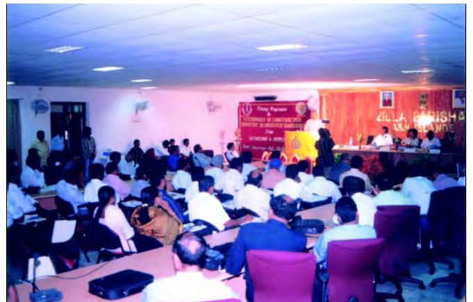
Attentive gathering in Executive Development Programme (EDPs) Organised for Officers of Andaman & Nicobar Administration

One of the major initiatives taken up by CIDC is up gradation of competence of our construction manager. In this direction, focused quality improvement seminars and EDPs are being offered by CIDC. Projects and Contract Management being vital areas form the core matter of such short-duration programmes. MES (Engineer-in-Chief's Branch, Indian Army) has been the major beneficiary from such programs, which are being offered by CIDC on regular intervals. However other government & private organizations have also shown a keen interest.