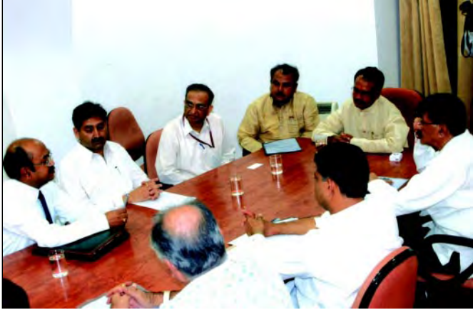
Signing of MoUs with Govt of Madhya Pradesh in the presence of Shri Shivraj Singh Chauhan, Hon'ble Chief Minister of Madhya Pradesh