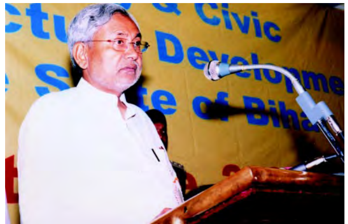
Hon'ble Chief Minister of Bihar, Shri Nitish Kumar, addressing the seminar on "Housing and Civic Infrastructure Development in the state of Bihar"

Concerned with rampant turning of the ancient city Patna into a concrete jungle, Shri Nitish Kumar, Chief Minister of Bihar welcomed the idea to set up a state-level Construction Industry Development Council (CIDC) which would suggest ways to usher in planned urban development in the state and to provide systemic support for the growth and development of physical infrastructure in Bihar.