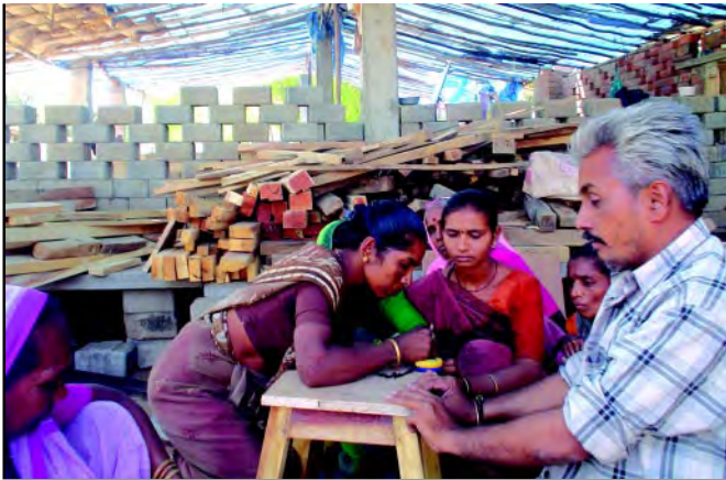
Institutional Training for Holistic Human Capital Development

Our Human Resource Development programmes have now gained excellent momentum. After a resounding success in Haryana, the same is now being extended in Rajasthan, Madhya Pradesh & Bihar. The State governments have entered into a Memorandum of Understanding (MoU) with Construction Industry Development Council