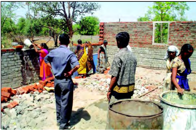
On site training of Construction Workers by professional trainers

The following Construction Workers Training / Certification Programmes were organized by CIDC during the April - June period:-